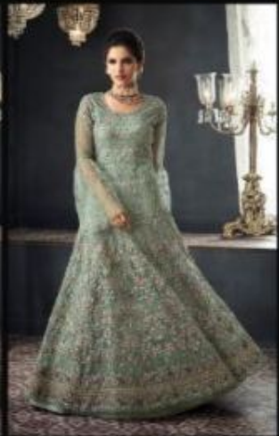
Glamour # 66002