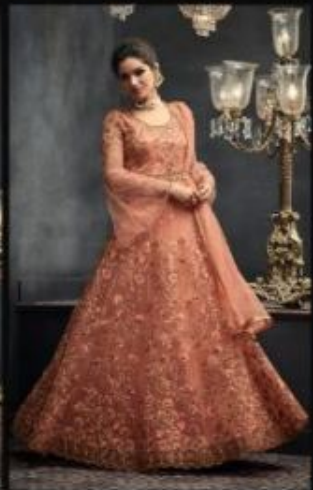
Glamour # 66004