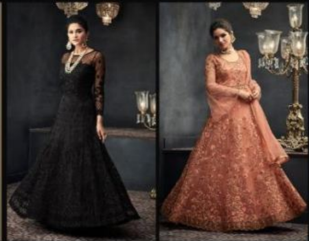
Glamour # 66003