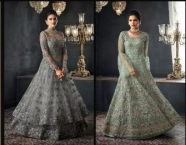
Glamour # 66001